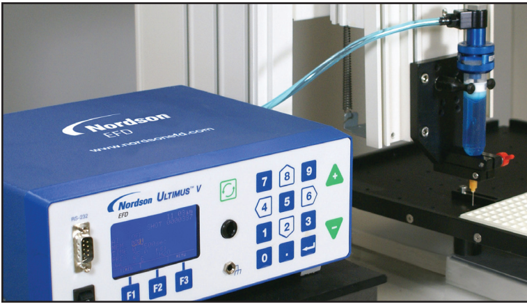
High speed microdot dispensing with Ultimus V and Optimeter.