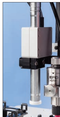
Pencil camera verifies product presence.

Nordson EFD's EV Series automated systems include simple vision for precise fluid dispensing using EFD syringe barrel and valve systems.