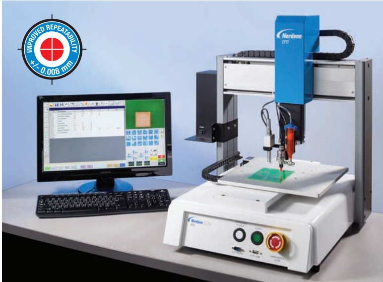
EV Series pencil camera vision makes programming patterns easier.

Easy automation for precise fluid application with simple vision pencil camera